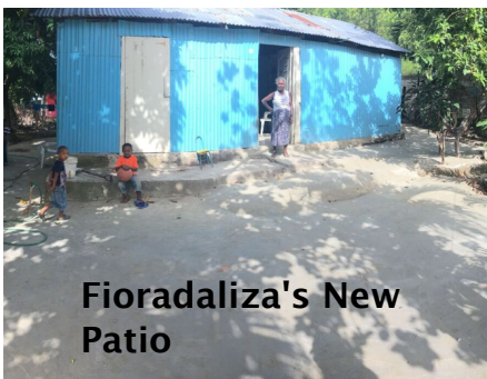
Fioradaliza's New Patio